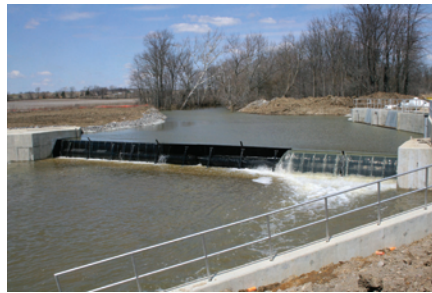
Inflatable dam bladder and gate slightly down