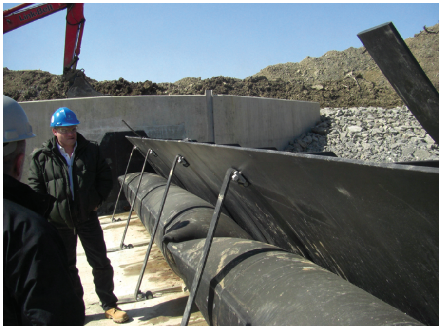
The inflatable dam has individual bladders that are used to raise and lower the structure. The contract encompassed the construction of a dam, intake structure, an inflatable dam, and a pump station building.

One of the four contracts encompassed the construction of a dam, intake structure and a pump station building, in addition to the installation of an inflatable dam that was to be purchased under a separate contract. The inflatable dam system monitors water flow and levels in Mill Creek, and adjusts the amount of water diverted to the new reservoir to maintain environmentally friendly flow conditions. In addition to monitoring stream flows and water levels at the dam, the pump